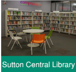
Sutton Central Library