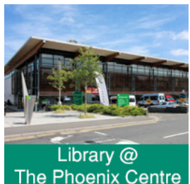
Library @ The Phoenix Centre

Alcorn Close, Sutton, SM3 9PX Telephone: 020 8644 9696 Email: lifecentre.library@sutton.gov.uk