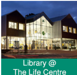
Library @ The Life Centre

Green Wrythe Lane, Carshalton SM5 1JJ Telephone: 020 8648 6608 Email: circle.library@sutton.gov.uk