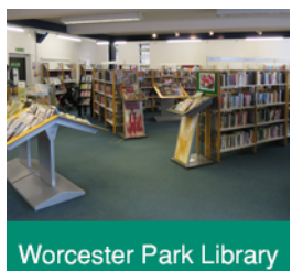
Worcester Park Library

Mollison Drive, Roundshaw, Wallington SM6 9NZ Telephone: 020 8770 4901 Email: phoenix.library@sutton.gov.uk